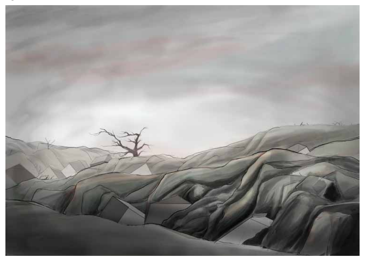
Figure 8: Ruins of the houses and the Teratorn's tree