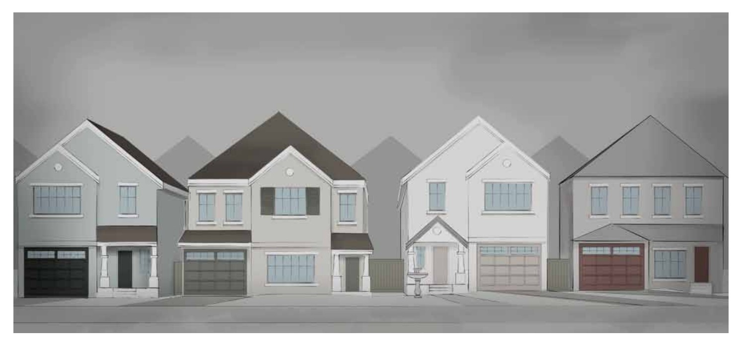
Figure 7: Suburban houses in elevation view