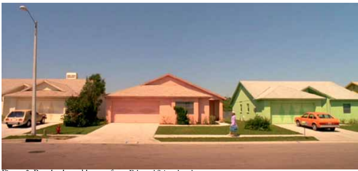
Figure 3: Pastel coloured houses from Edward Scissorhands

"Edward Scissorhands Screen Caps from Eclectric Dragonfly, page 1 of 4." alicia-logic.com home. N.p., n.d. Web. 22 Sept. 2013. <a href="http://www.alicia-logic.com/capspages/caps_viewall.asp?titleid=65">http://www.alicia-logic.com/capspages/caps_viewall.asp?titleid=65></a>.