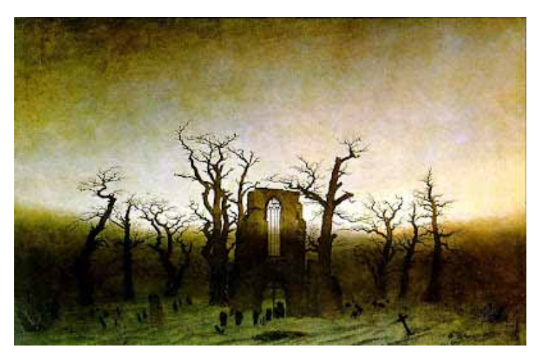
Figure 2: The Abbey in the Oakwood , Caspar David Friedrich

The design of the backgrounds was also much inspired by the romantic landscape paintings of Caspar David Friedrich, for example, The Abbey in the Oakwood (shown below). There is juxtaposition of death and ruin on the ground plane, with hope of renewal in the sky emphasized by vertical rhythm of the ruined cathedral, and the gnarled trees reaching up.