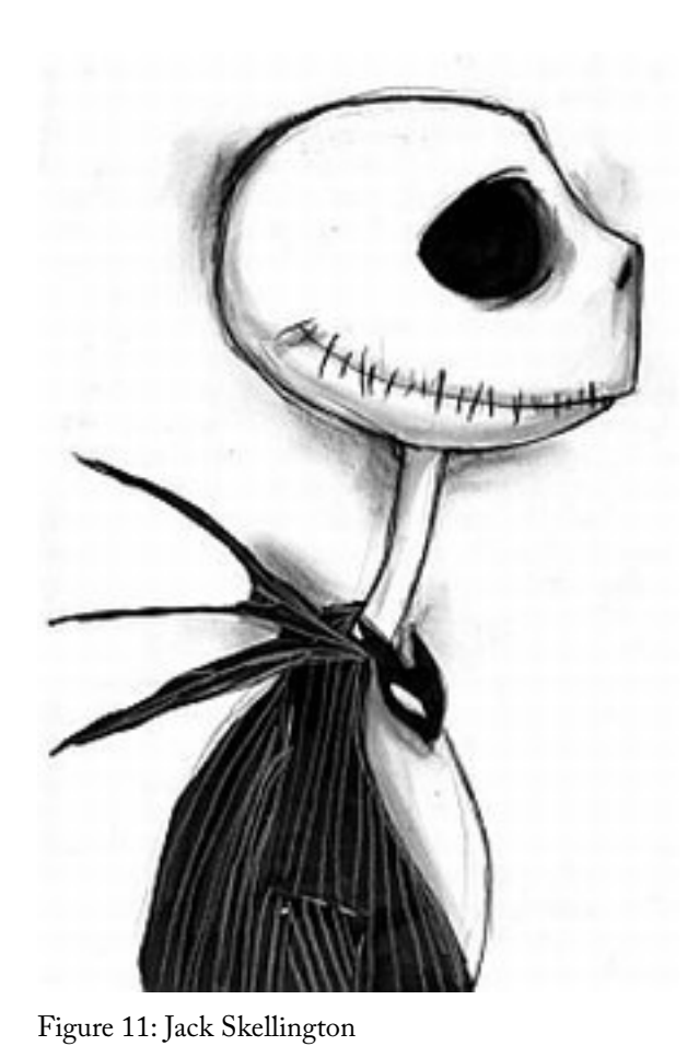
"Jack Skellington - Disney Wiki." Disney Wiki. N.p., n.d. Web. 22 Sept. 2013. <a href="http://disney.wikia.com/wiki/Jack_Skellington">http://disney.wikia.com/wiki/Jack_Skellington</a>>.