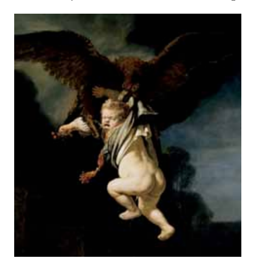
Figure 1: Rape of Ganymede, Rembrandt

The story of Teratorn was conceived as a contemporary interpretation of the myth. The plebian country side home of Ganymede is now shown as an unexciting modern suburb, and Ganymede himself is now depicted as a bored boy walking through it.