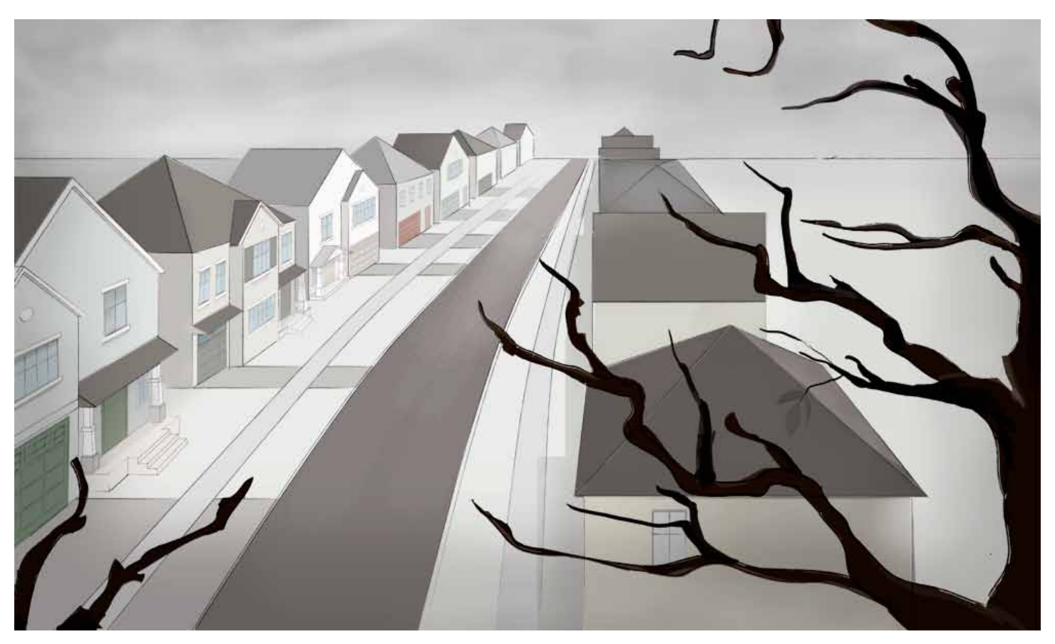
Figure 5: Opening scene of Teratorn