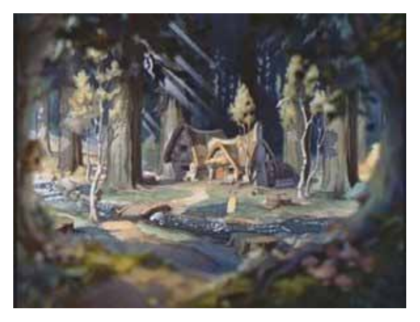
Figure 9: Use of the multiplane camera in Snow White to achieve a layered feel.

This is a based on techniques of layering used in traditional cel-animation dating back to around 1915 and the animated series Bobby Bump by Bray productions. The first significant animated feature to use separation of foreground, background and middle ground elements on different planes was Disney's Snow White<sup>4</sup>. The layers were physically separated into different planes and were filmed by a multi-plane camera to enhance the sense of perspective.