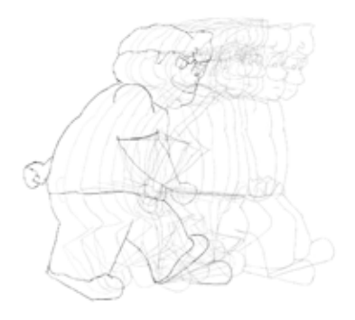
Figure 12: The walk progression.