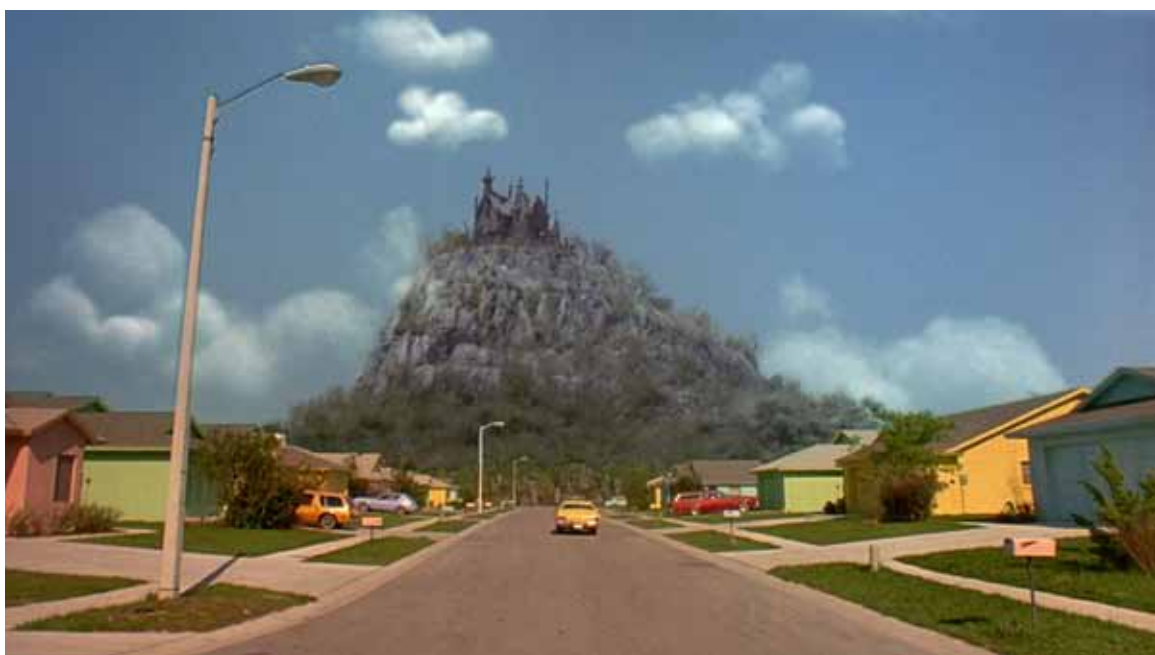
Figure 4: The ominous castle from Edward Scissorhands

"Edward Scissorhands Screen Caps from Eclectric Dragonfly, page 1 of 4." alicia-logic.com home. N.p., n.d. Web. 22 Sept. 2013. <a href="http://www.alicia-logic.com/capspages/caps_viewall.asp?titleid=65">http://www.alicia-logic.com/capspages/caps_viewall.asp?titleid=65></a>.