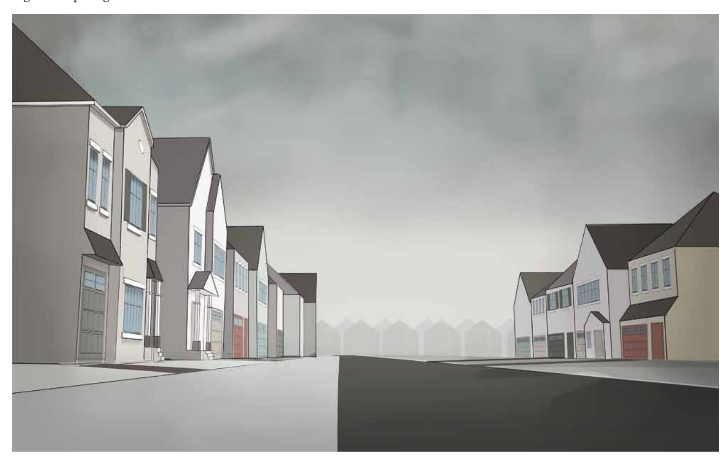
Figure 6: The street in perspective view