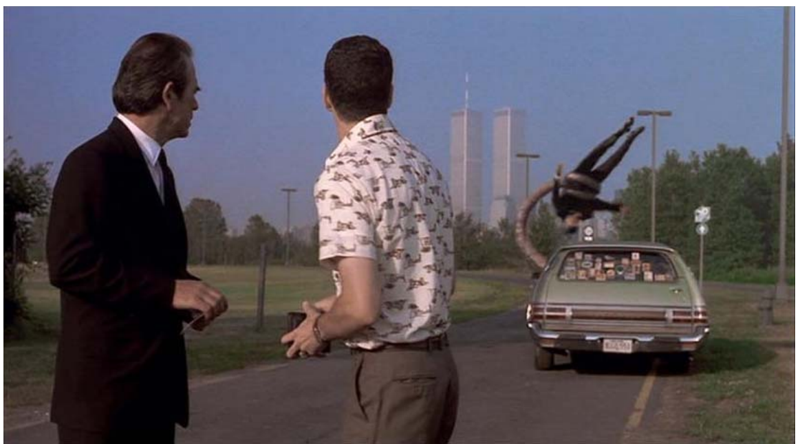
Fig 5: Men In Black (1997) The World Trade Towers form an establishing backdrop behind a comedic scene in Men In Black

Where the inclusion of live footage of the World Trade Towers in the New York skyline pre 9/11 had been used to proudly symbolize a modern New York, one that had ultimately escaped the overriding nostalgic influence of Hugh Ferriss, post 9/11 resulted in a different appreciation of the Twin Towers as they could no longer be viewed casually. The event resulted in a strained relationship between viewers and the New York skyline. Much of this had to do with the obvious void in the new skyline. To catch glimpses of the towers employed as mere "city identity backdrops" in earlier films such as Men In Black (1997), positioned a tragic element in a comedic view that to this day can elicit feelings of anxiety or guilt. In reaction, directors have taken varying approaches to dealing with this potentially sensitive issue.