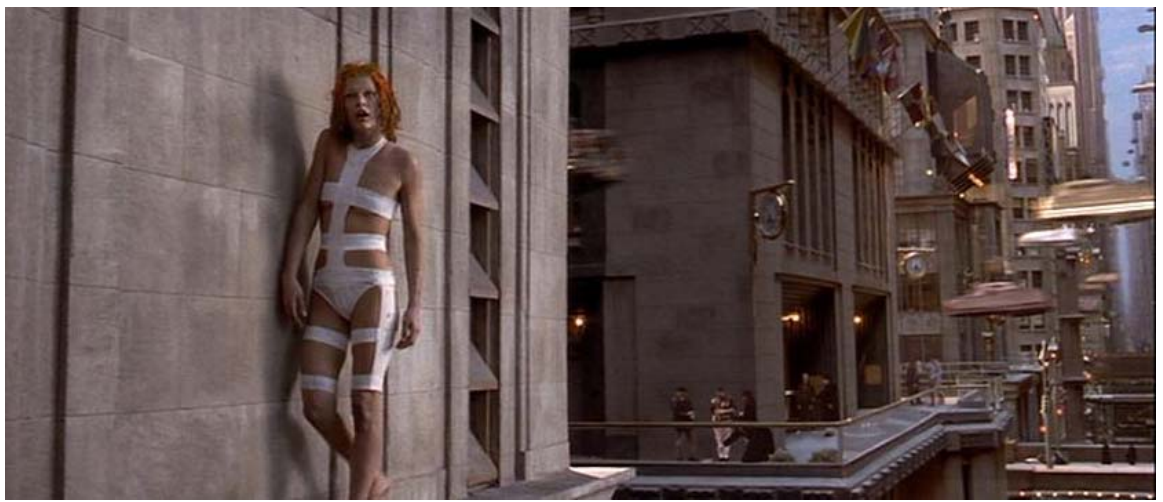
Fig 11: The Fifth Element (1997) Leeloo walks along a projecting stone ledge in The Fifth Element