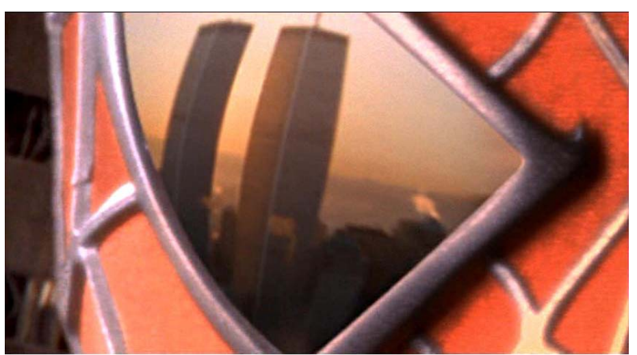
Fig 7: Spiderman (2002) The reflection of the World Trade Center can be seen in Spiderman's eyes in the 2002 release of the film.

Much has been written in technical literature regarding the production of Spiderman as to the creation of its mid town cityscapes and their relationship to the more historic idea of New York. Interestingly, one fleeting scene does remain where the reflection of the World Trade Towers can be clearly seen in Spiderman's eyes – a subtle reference to an architectural element otherwise extraneous to the plot of the film.