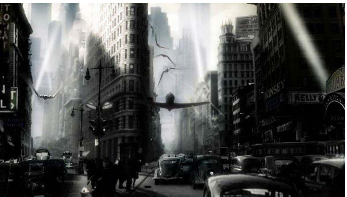
Fig 9: Sky Captain and the World of Tomorrow (2004) The Flatiron Building provides the immediate setting for Sky Captain, with shadows of the skyscrapers hovering in the background.

Conran also employs a pseudo sepia tone as well to create a highly stylized, nostalgic version of the city. At one point in production the film was also to have an aged "grain" applied, but tests proved it too distracting so this was abandoned.<sup>32</sup> They did, however, freely move the images and ghostlike silhouettes of the Empire State Building around the setting, to better position them for the scene – much like characters in a photo shoot. Iconic images of New York architecture of the period in the "establishing shots" were central to the understanding of the context.