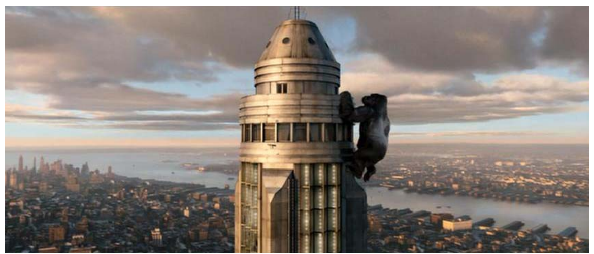
Fig 10: King Kong (2005) King Kong climbs to the top of the Empire State Building, making physical use of the detail provided by the architectural style of the period.

"New York City is vast," stated Letteri. "We knew it would be impossible to build every building, so we researched into what the city was like in 1933, used original blueprints of landmark buildings, like the Empire State Building and the Chrysler Building, then picked city views that were key to the story and built around those landmarks."<sup>34</sup>