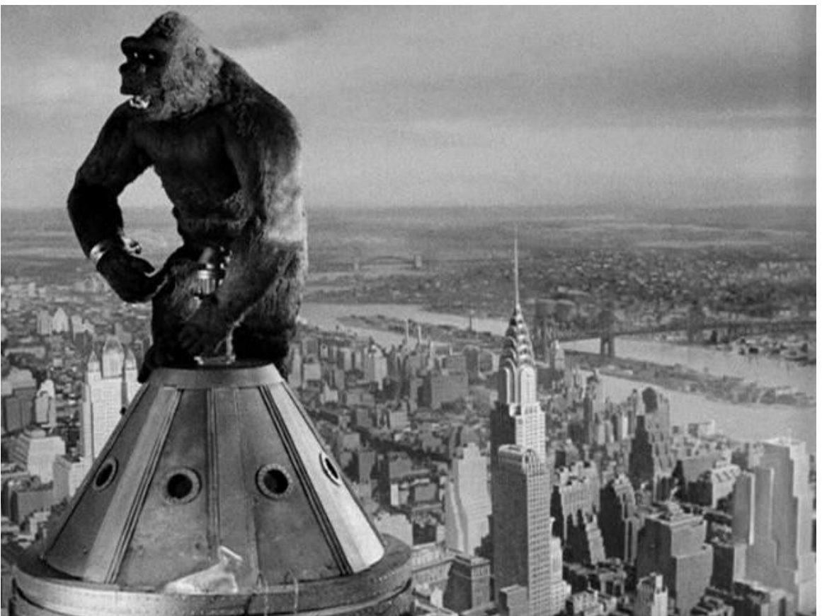
Fig 2: King Kong (1933) Although quite advanced for the time, the techniques used to both animate and superimpose King Kong against the New York skyline in 1933 leave the viewer knowing that special effects have been employed.

The 1933 version of King Kong brought the model based image of the Empire State Building, then the tallest structure in the world, to the forefront of the public eye, through the establishing shots created for the film. The movie role of the building was close in significance to that of the giant ape or Fay Wray. In the 2005 Peter Jackson remake of the film, the CGI version of the aerial view of New York City offers a super realistic and somewhat uncanny recall of the state of the city in 1933, and continues to allow the identifiable architecture of the Empire State Building to take a dominant role in the film cast.