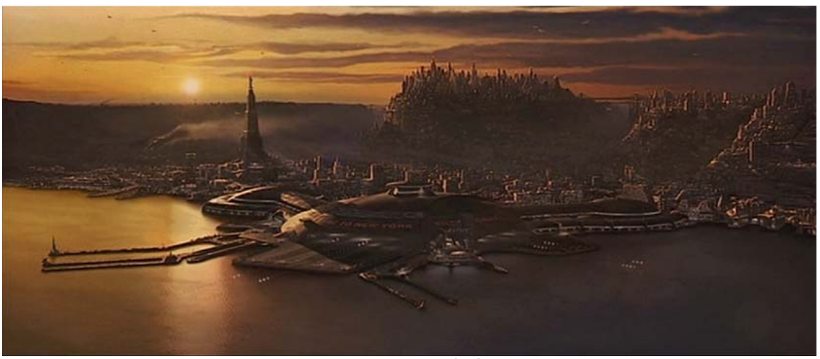
Fig 3: The Fifth Element (1997) Jean-Claude Mézières' New York skyline for The Fifth Element.

town where there is a clear vertical hierarchy created that somewhat parallel's Lang's Metropolis , with the exception that it occurs entirely above grade. The upper portion of the towers represent good and light. The mid section is used for day to day living, and the ground level is devoid of light, citing a limitation of the effectiveness of the Ferriss cross section, and provides a foggy, lurid environment. This future New York thereby repositions the danger that was once constrained to the back alley, to a complete occupation of the ground plane of the city.