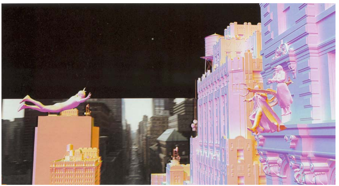
Fig 12: Spiderman 2 (2004) The wide shot of the bank exterior layered CG environments against a digital tile of live action background plates that had been shot in New York City. A screen shot of the composite showing the relationship between the actors and the building exterior from Spiderman 2.40

The third installment of the Spiderman series (2007) places the city of New York in a starring role, while continuing the escapism offered by the super-hero film genre. There is a subtle "creep" that is evident in Spiderman 3 , towards a more visible use of easily identifiable New York icons. The views of the skyline in Spiderman (2002) are all nighttime views, with only the hazy lights of the Chrysler Building vaguely recognizable beyond Spiderman's web. In Spiderman 2 , we see the Empire State Building as a reflection in the glass, reminiscent of the way that Jacques Tati incorporated the icons of Paris into the modern setting of Playtime (1967).<sup>41</sup> Although Peter Parker still resides in the same apartment in Spiderman 3 , the Empire State Building has been relocated several blocks closer to Parker's apartment, so that its presence is clearly felt in each day or night view out into the city – re-establishing the iconic "establishing shot" so traditional in earlier films.