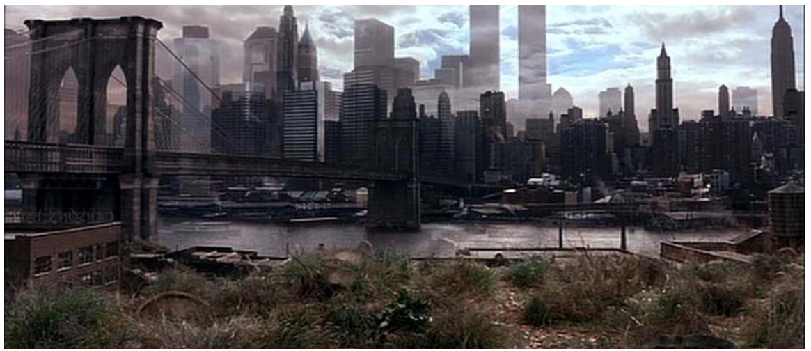
Fig 6: Gangs of New York (2002) In Gangs of New York the 1863 skyline fades into a pre 2001 version that includes the World Trade Towers along with other iconic elements of the 20<sup>th</sup> century.