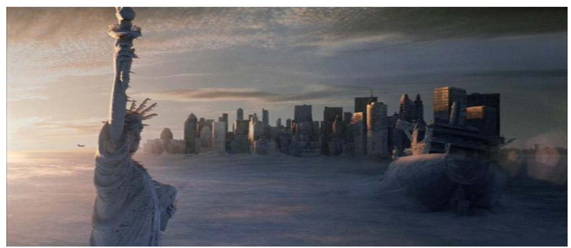
Fig 8: The Day After Tomorrow (2004) The CGI view of the frozen New York skyline, featuring the Statue of Liberty.

Lidar based CG which used a customized laser scan to digitally scan the forms and details of the city. The impetus was to make the ice covered buildings look in scale and not as if they were miniatures or CG – a problem when the normal brick, glass and stone textures were to be replaced by ice. The composite ending shot of the film consisted of more than 300 layers. ^{30}