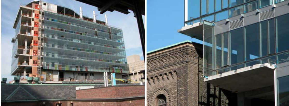
Figure 11: Innovation and Design Process: Centre for Cellular and Biomolecular Research, University of Toronto, Benisch and Benisch. Double skin façade construction in progress. The building also uses innovative planning to separate less climate controlled corridor spaces from highly controlled laboratories. Two storey planted atriums will be located at the corners of the south face of the building.

Increased interest in innovative sustainable design construction methods that have more recently been imported from European models, such as double skin wall façade systems, can also qualify for an innovation point. These buildings are normally more sustainable motivated, and the double skin wall system will also impact issues of perimeter control, access to natural ventilation, indoor air quality, thermal quality, envelope performance as well as protection of shading devices in harsh climates. Such systems can now be seen in the Telus/William Farrell Building designed by Busby and Associates in Vancouver, the Caisse de Depots et Placement, in Montreal, the Centre for Cellular and Biomolecular Research at the University of Toronto, by Benisch, Benisch with Architects Alliance and the Seattle Justice Center by NBBJ Architects. However, decisions to include such product and material intensive systems may well work against aspects of Zero Carbon design. Therefore, the benefits would have to be carefully weighed against the additional use of material, associated energy and the potential for energy savings over the long term.