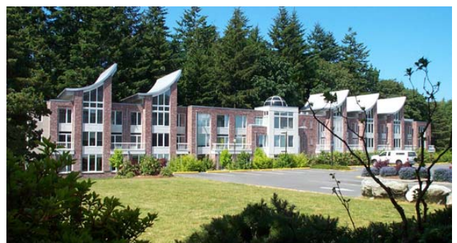
Figure 7: C.K. Choi Institute for Asian Studies, UBC, Matsuaki Wright Architects Materials and Resources: Credit 4 Recycled Content (both the timber frame and brick veneer cladding) Reuse of brick for cladding can bring concerns regarding the "life left" of the product from the point of view of durability and weathering.

The idea behind the Regional Materials credits focuses on embodied energy issues as a function of transportation costs. The requirements for this credit have been eased from the USGBC version due to the larger travel distances inherent to Canada. The limiting distance as within a 500-mile (800 km) radius and refers to the location of final assembly of the materials into the manufactured product – the materials themselves may come from further afield. Shipping via train or boat is preferred to truck due to CO_2 and infrastructure concerns.