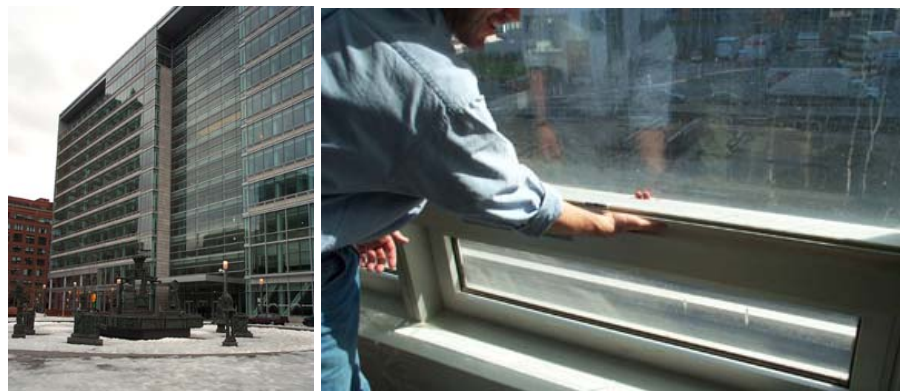
Figure 10: Innovation and Design Process: Caisse de Depots et Placements, Montreal Double skin wall construction.

Increased interest in innovative sustainable design construction methods that have more recently been imported from European models, such as double skin wall façade systems, can also qualify for an innovation point. These buildings are normally more sustainable motivated, and the double skin wall system will also impact issues of perimeter control, access to natural ventilation, indoor air quality, thermal quality, envelope performance as well as protection of shading devices in harsh climates. Such systems can now be seen in the Telus/William Farrell Building designed by Busby and Associates in Vancouver, the Caisse de Depots et Placement, in Montreal, the Centre for Cellular and Biomolecular Research at the University of Toronto, by Benisch, Benisch with Architects Alliance and the Seattle Justice Center by NBBJ Architects. However, decisions to include such product and material intensive systems may well work against aspects of Zero Carbon design. Therefore, the benefits would have to be carefully weighed against the additional use of material, associated energy and the potential for energy savings over the long term.