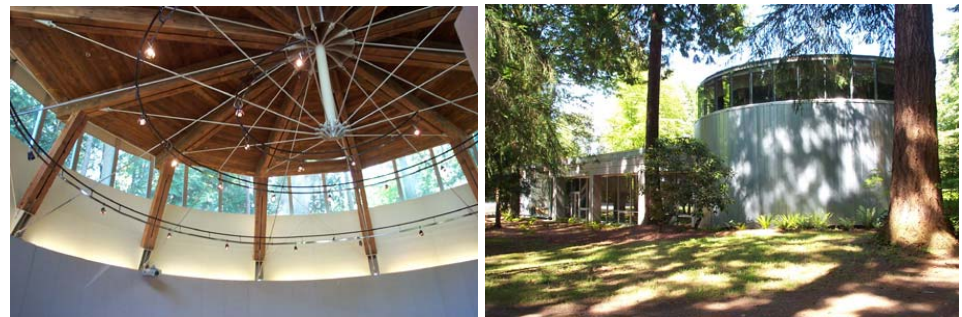
Figure 6: Liu Centre for Asian Studies, UBC, Architectura Materials and Resources: Credit 4 Recycled Content – timber framing. The building also uses flyash in its concrete – a waste product of the steel industry.

Recycled Content credits also require additional investigation when sourcing and specifying materials. It is also important to consider whether or not the materials used in the building envelope have potential for recycling when they are no longer useful in the building: the "Cradle to Cradle" concept.<sup>2</sup> This will also affect the way we build and fasten products as design for disassembly may be required at some point in the life of the building.