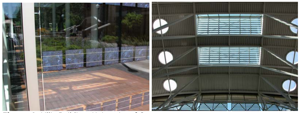
Figure 4: Lillis Building, University of Oregon Energy Efficiency: Credit 1: Optimize Energy Performance: Crystalline PV is integrated into the south façade glazing and skylights – serving a double function as a shading device.

The emergence of Building Integrated Photovoltaic systems (BIPV) presents new considerations in envelope design and can create an even more efficient envelope if it is capable of also producing electricity.