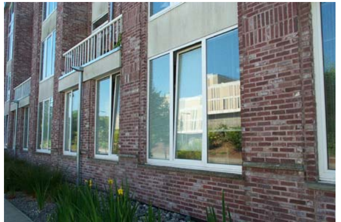
Figure 9: C.K. Choi Institute for Asian Studies, UBC, Matsuaki Wright Architects Indoor Environmental Quality: Ventilation Effectiveness + Control of Perimeter systems

Figure 8: Mountain Equipment Coop, Toronto, Stone Kohn and Vogt Architects Indoor Environmental Quality: Credit 8 Daylighting – use of glazing to daylight the space can increase heat loss (winter) or heat gain (summer) if not properly detailed and specified