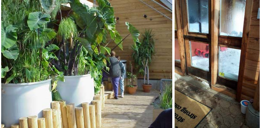
Figure 3: YMCA Environmental Learning Centre, Charles Simon Architect Water Efficiency: Credit 2 Innovative Wastewater Technologies: Living Machine<sup>TM</sup> – adjacent doors suffering from deterioration due to the high moisture content of the room

Humidity issues at the YMCA Environmental Learning Centre (pictured below) are handled in part by high level ventilation, even in the winter months. Wood doors adjacent to this space show high signs of deterioration due to humidity and mold growth as a result of the Living Machine<sup>TM</sup>.