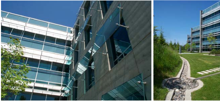
Figure 5: BC Gas (Terasan Gas) Musson, Cattell Mackey Partnership Energy Efficiency: Prereq 2: Minimum Energy Performance: Solar shading to reduce energy consumption. Differentiated façade strategies as a function of orientation.