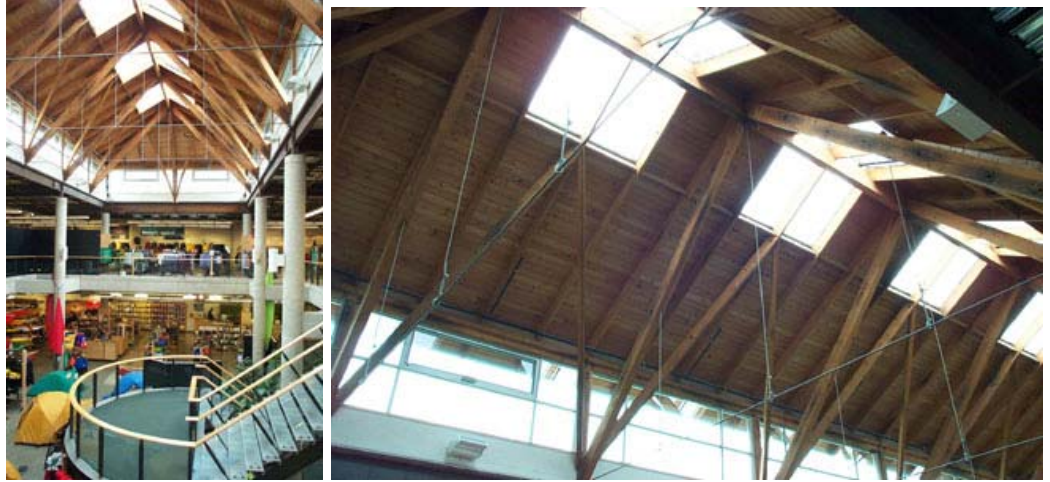
Figure 8: Mountain Equipment Coop, Toronto, Stone Kohn and Vogt Architects Indoor Environmental Quality: Credit 8 Daylighting – use of glazing to daylight the space can increase heat loss (winter) or heat gain (summer) if not properly detailed and specified

Issues of mold in the building envelope (migrating to the interior) or building itself due to improper ventilation practices are dealt with in the IEQ credit categories. Detailing of the envelope system to prevent mold, although not directly stated, is inferred in this category.