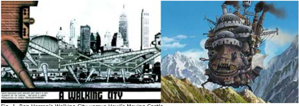
Fig. 1. Ron Herron's Walking City versus Howl's Moving Castle.

vision Whereas the extraordinary architecture that drove the work of Boullée simply stretched the structural capacity and orientation of the traditional materials of the time, using traditional forms, the excited musings of Archigram and all during the 1960s proposed architectural alternatives that questioned everything, from the materiality and mechanical systems proposed, down to the static location of urban environments. Ron Herron's "Walking City" remains guite unrealizable in "buildable" terms, but would not be beyond the capabilities of any CGI unit at Lucas Film or the animation team at Studio Ghibli, as recently shown in the 2005 film "Howl's Moving Castle", based upon the novel by Diana Wynn Jones. Howl's Moving Castle brings a magical Walking House to life, in perhaps a more realistic, although animated style, than was represented by Herron's renderings.