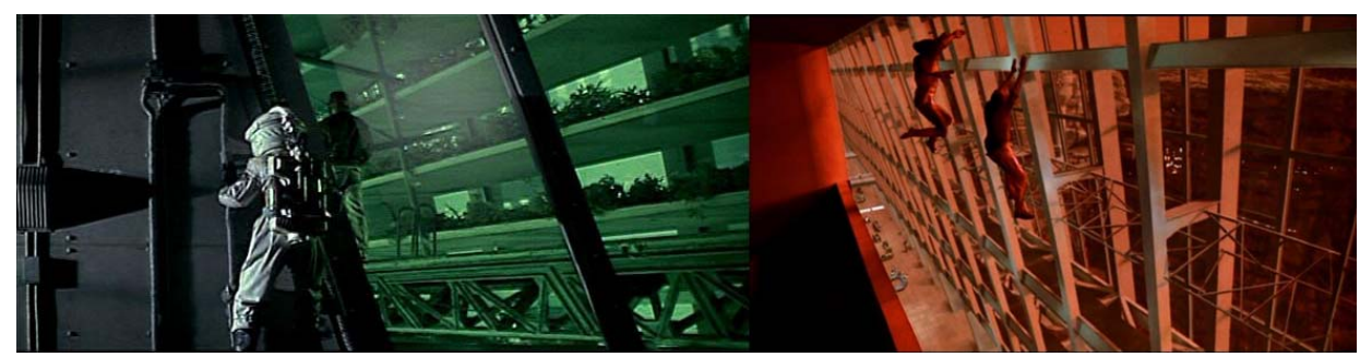
Fig. 4. Expansive glass skins: Outland (left), Total Recall (right) -the "interiorization" of the urban environment

glass or thin architectural skins in direct relationship to their non earth locations. "Silent Running" and "2001" also work the vulnerable aspect of skin into their plot lines and architecture. The giant geodesic domes in "Silent Running" play upon the tenuous position of man and his small piece of the environment as it floats in space.