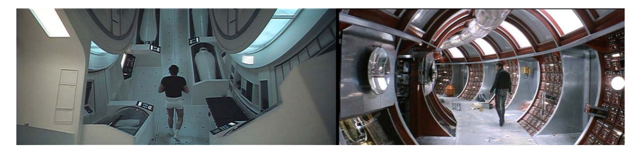
Fig. 3. Interiors: 2001 (left), Solaris (right)

A combination of budget and technology gave rise to the predominant use of scale models to create both environments as well as spacecraft. With the exception of select full scale sets, distance views of the space craft and planetary environments of "2001", "Silent Running", "Total Recall", "Outland" and the earlier "Star Wars" installments, all employed highly detailed scale models that were placed environments larger using screening techniques. It was this method that allowed the visual effect of zero gravity. More sophisticated movements camera assisted in releasing film environments from a dependency on a more rigid camera position that had reinforced a gravity-bound view of the set. Cameras that can now run on tracks at computer controlled rates have the ability to simulate flight more believably.