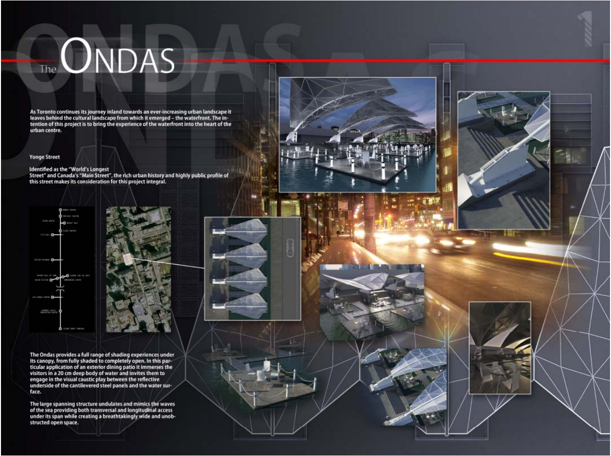
Figure 2: SSEF 2008 Award of Excellence for a Cantilever Theme – final project for both building construction and digital design. Matin Moghaddam and Mathew Winter.