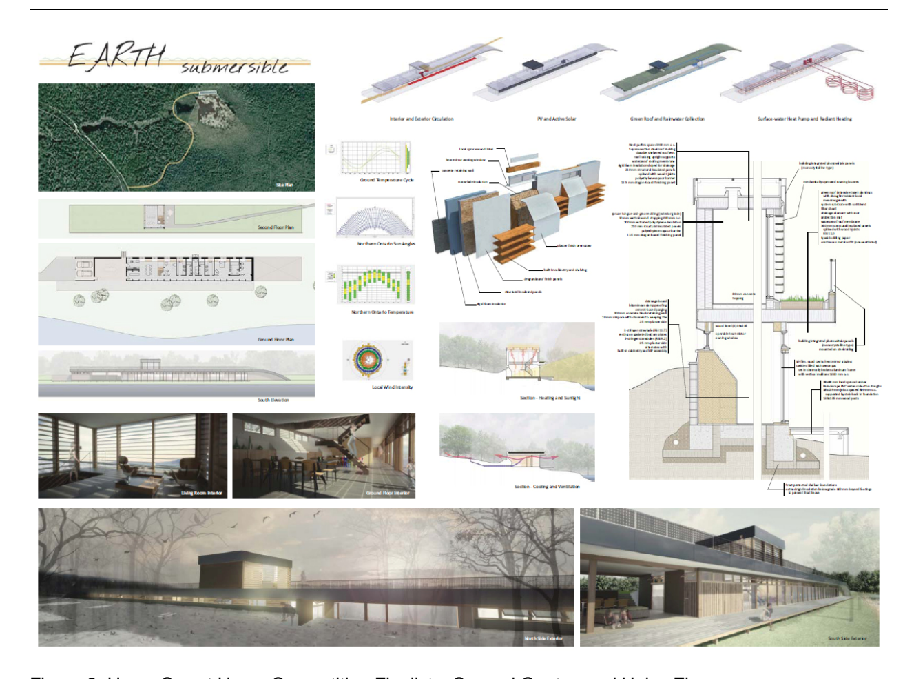
Figure 3: Home Sweet Home Competition Finalist – Samuel Ganton and Haley Zhou

still included the formality of "boards" and digital drawing to keep the bar raised, but the quality of the work declined somewhat as students resorted to using SketchUp to speed up the digital work, recognizing that these were not "real" competition submissions.